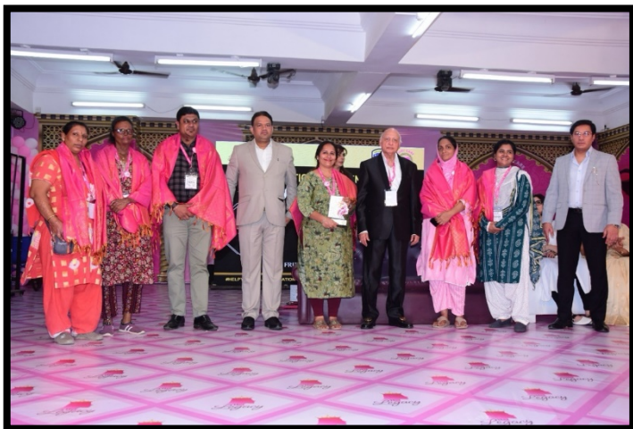
Members of Honeycomb Bal Ashram felicitated for empowering abandoned girl child