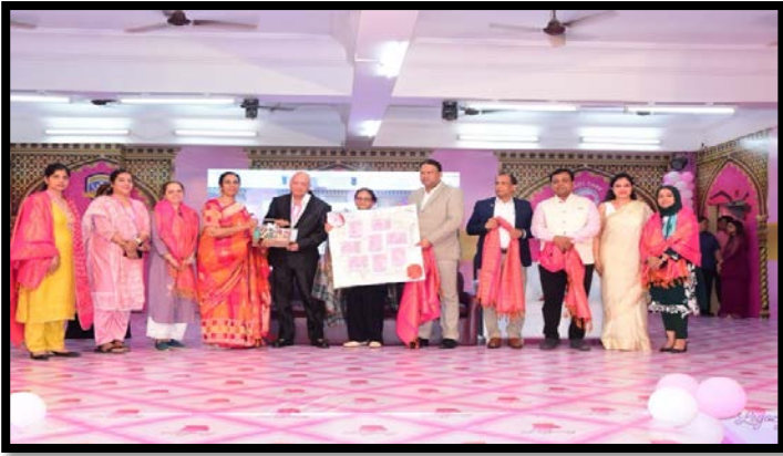
Female employees of RCoEd being felicitated on the occasion of IWD