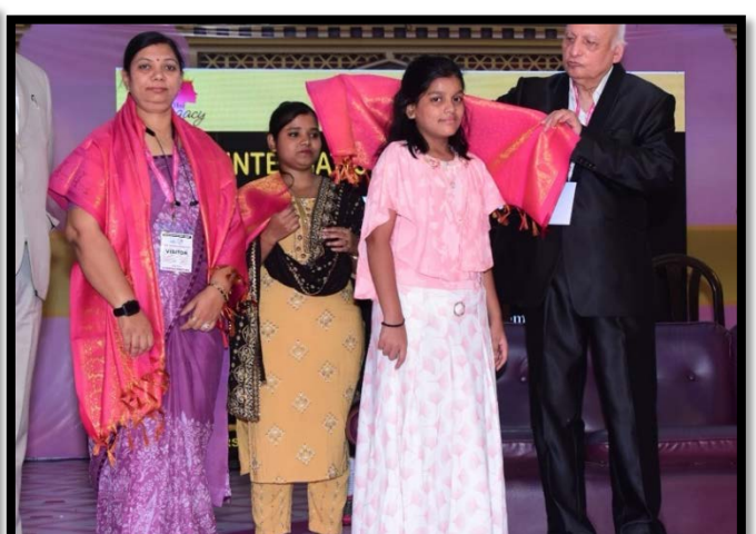
Felicitations of the Members of Acid Survivors & Women Welfare Foundation