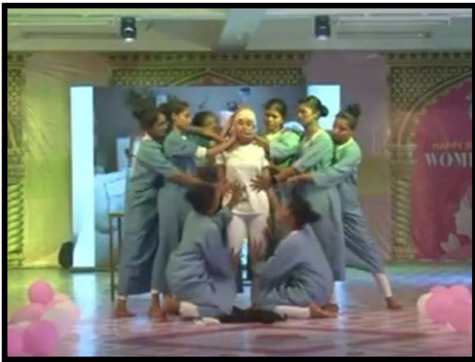
Dance performance by RCoEd student-teachers